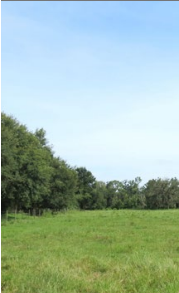
Utilities available in front of the property!