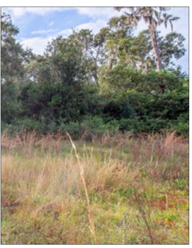
Convenient Location! Near SR 60, Brandon, Tampa, Plant City, I-75, and I-4 Close to Fish Hawk and Lithia

Enjoy Your Country Lifestyle and Still Have Easy Access to City Amenities!