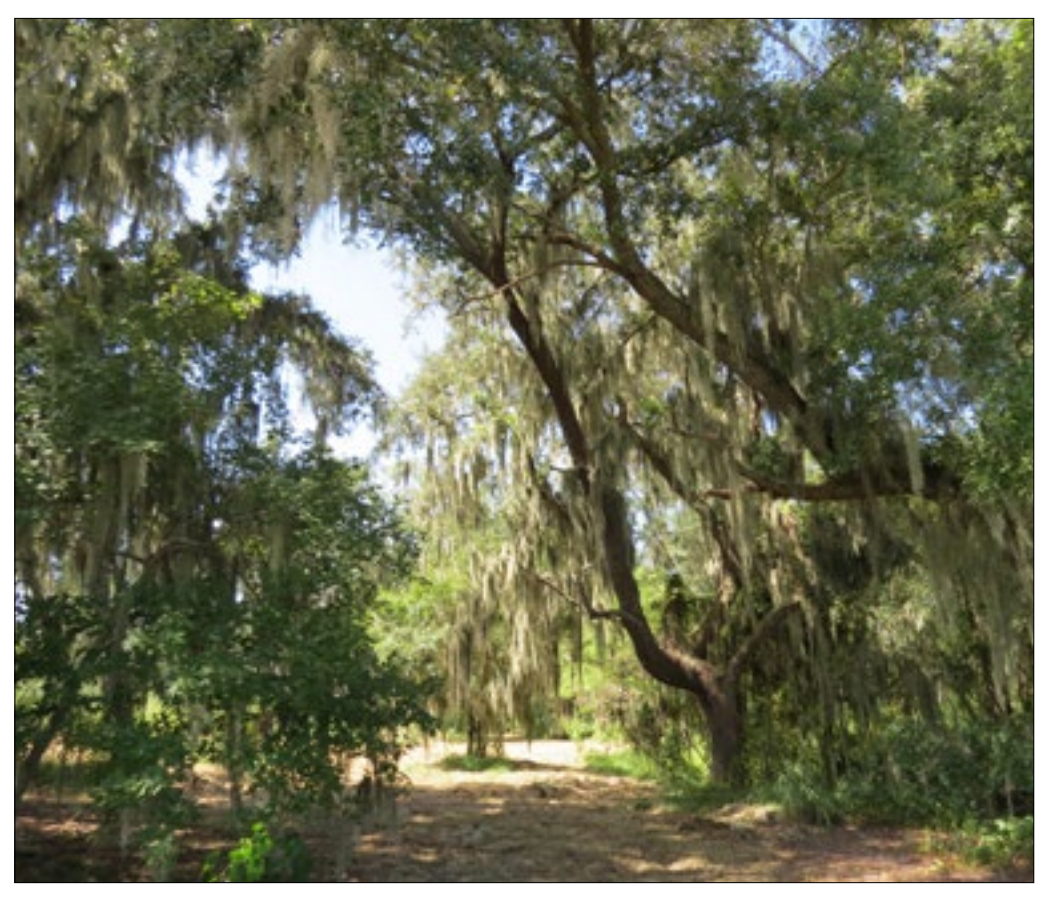
This Property Offers the Perfect Balance of Country Tranquility While in Close Proximity to Shopping, Dining, and Schools!

Gorgeous Grandfather Oaks with the Tranquil Ripple of Dug Creek