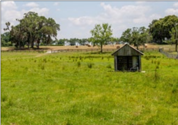
Barn and Cowpens Bring your Animals!