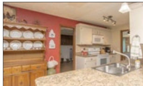
Updated Ranch Style Home Warm and Inviting Open Floor Plan